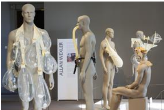
Allan Wexler Installation