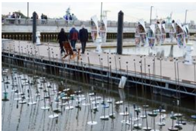
Jean - Yves Vigneau Water Flowers