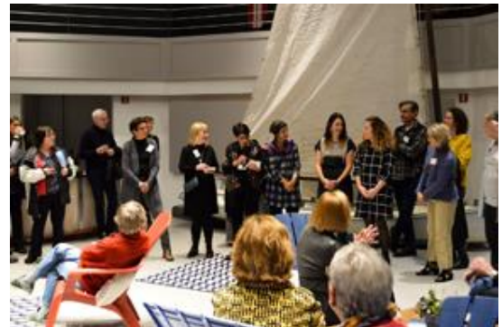
Artists at reception