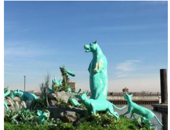
Happy Castaways (detail)

Could we have predicted everything that happened? I don't think so – we just did not have enough experience. FLOW was still immensely successful and brought an entirely different presence to the boat basin. The art was always intended to interact with nature, and it did.