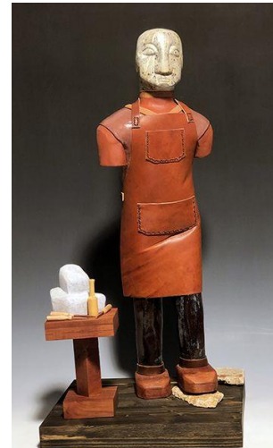
Paul Wandless Maker

John Y. Wind's solo show The Women was at InLiquid Gallery at Crane Arts, November 14 - December 14, 2019. An article about The Women , by A.D. Amorosi, was included in Dosage Magazine's November 11, 2019 issue.