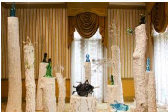
Tristin Lowe Pining for Mystics; walks, talks and molten rabbit holes