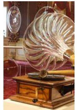
Phantom Frequencies Victrola (detail)