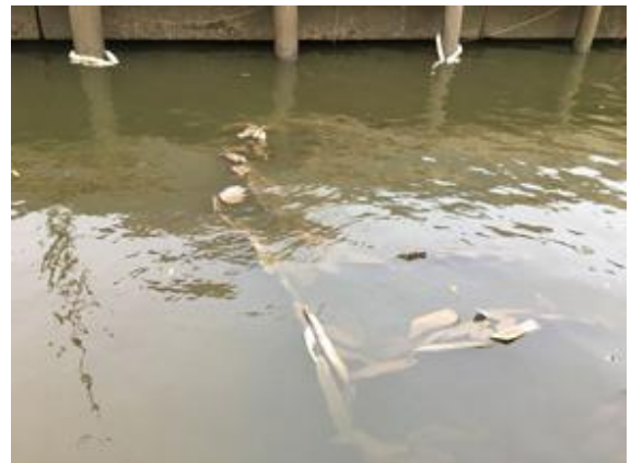
Evident Cycle - imprint & impact