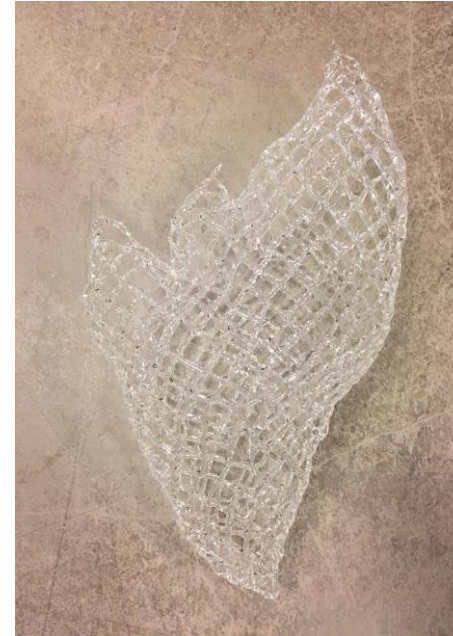
Marcy Chevali Untitled, 2022, flameworked borosilicate glass, 26 x 23 x 20 inches,