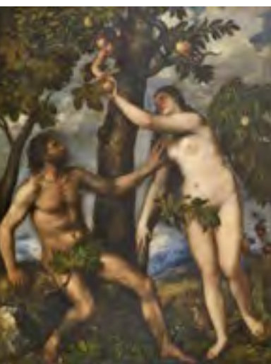
Titian Adam and Eve 1550

The composition of this work is stylized and the self-conscious figures mirror those of traditional representations of the Garden of Eden (see below). The process by which the work was created owes much to Surrealist-inspired automatic drawing techniques. I conduct research, gathering materials, information, and source images related to my subject. Then I immerse myself in the action, cutting, painting, pasting, spraying, assembling, allowing the final images emerge from the process, rather than being consciously dictated at the start of the day.