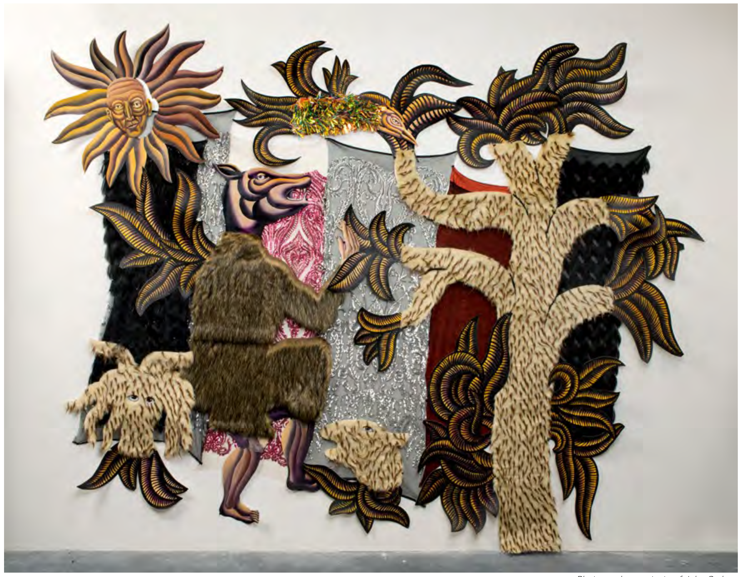
Coyote , 2022 Acrylic and fabric on paper, 120 x 144 inches, variable