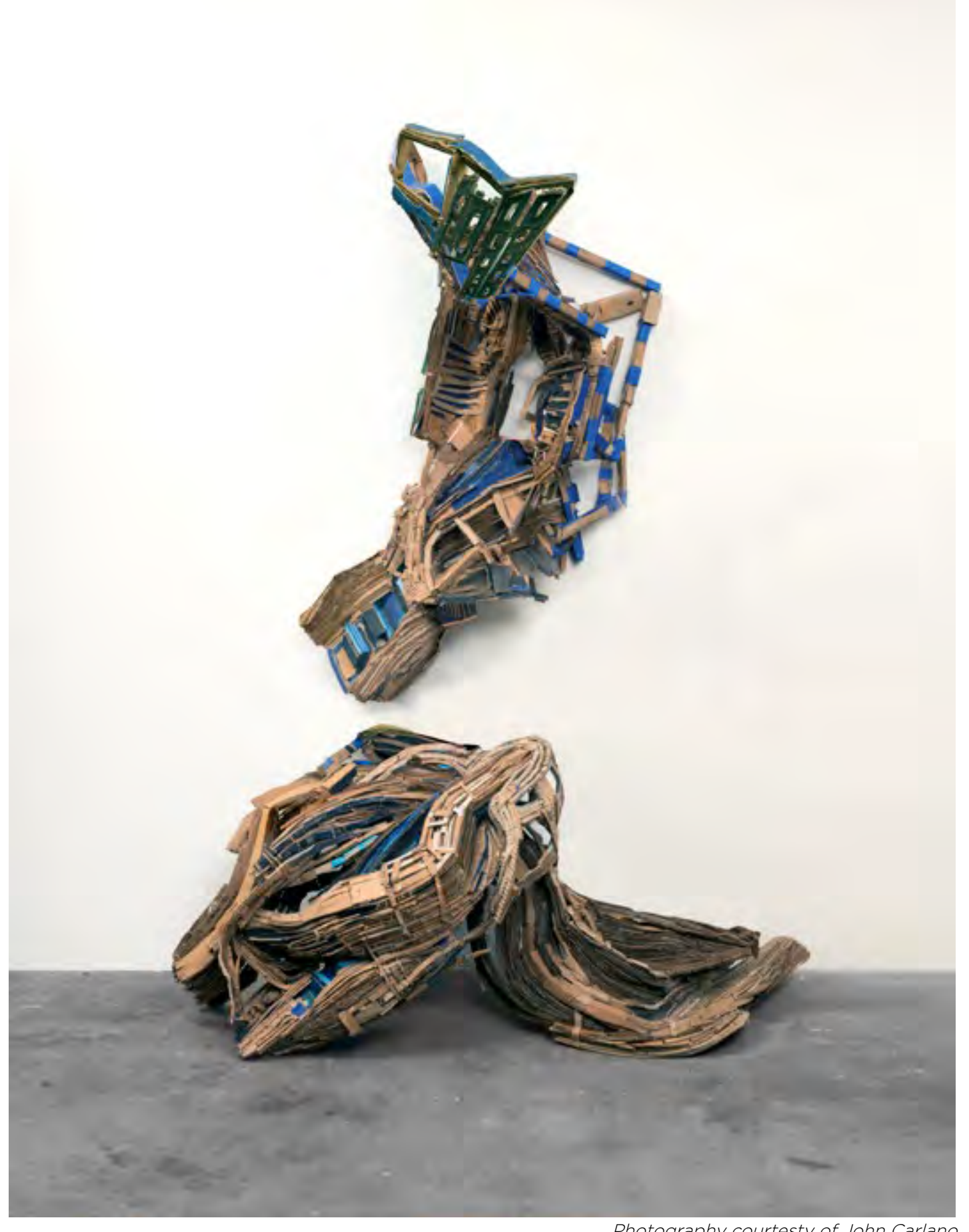
the remaining rumors live here, 2022 Raffia, cardboard, paint, 120 x 144 inches, variable