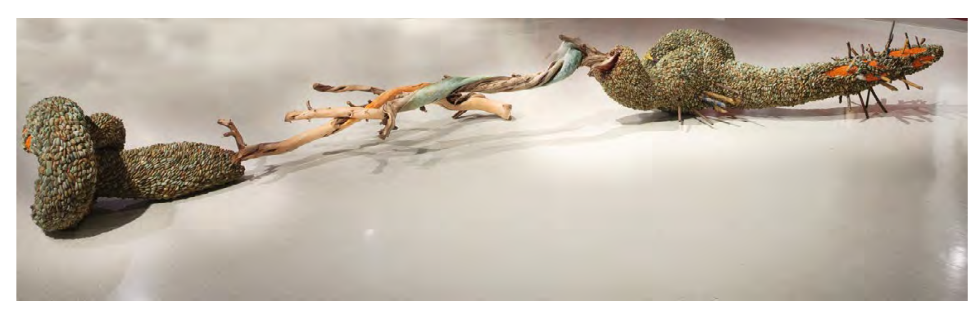
Umbilicus II , 2019 Indonesian jade stone, glass mosaic, monterey cypress, 178 x 35 inches, variable