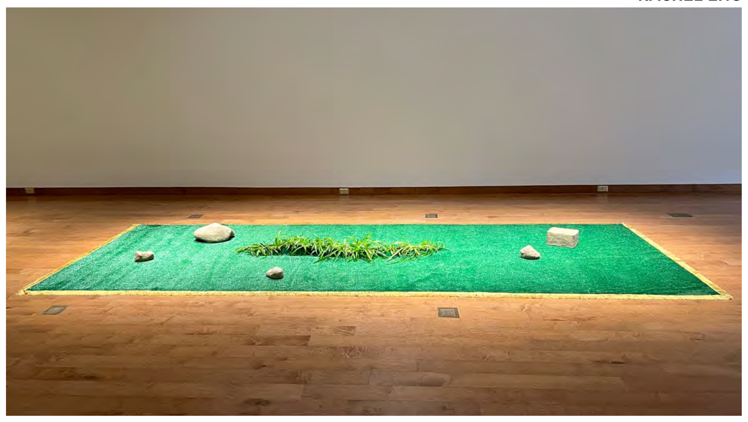
Expectations , 2021 Turfgrass, plants, ceramic, fringe, 72 x 168 x 4 inches