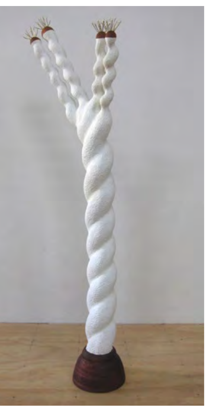
Ghost , 2010 Wood, brass, paint, beads on wood base, 77 x 28 x 12 inches