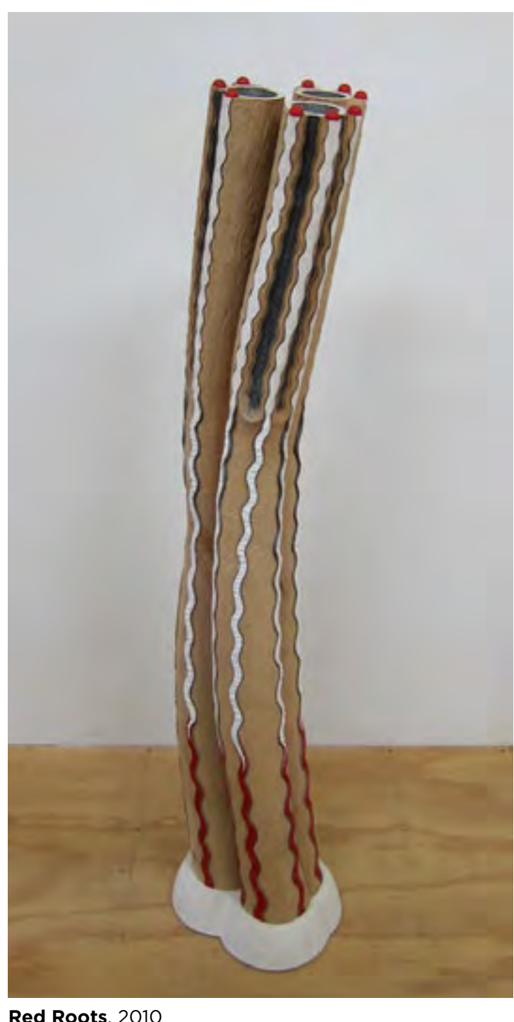
Red Roots , 2010 Sycamore, graphite and paint on concrete base, 65 x 10 x 12 inches