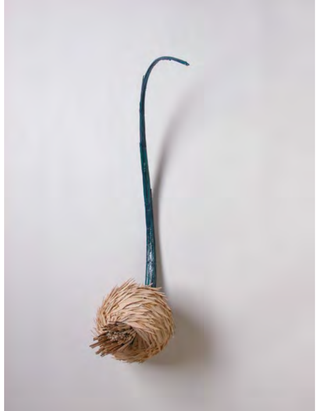
Thistle , 2004 Oak, maple, pigmented epoxy, 60 x 24 x 24 inches