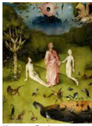
Hieronymus Bosch The Garden of Earthly Delights between 1490 and 1510