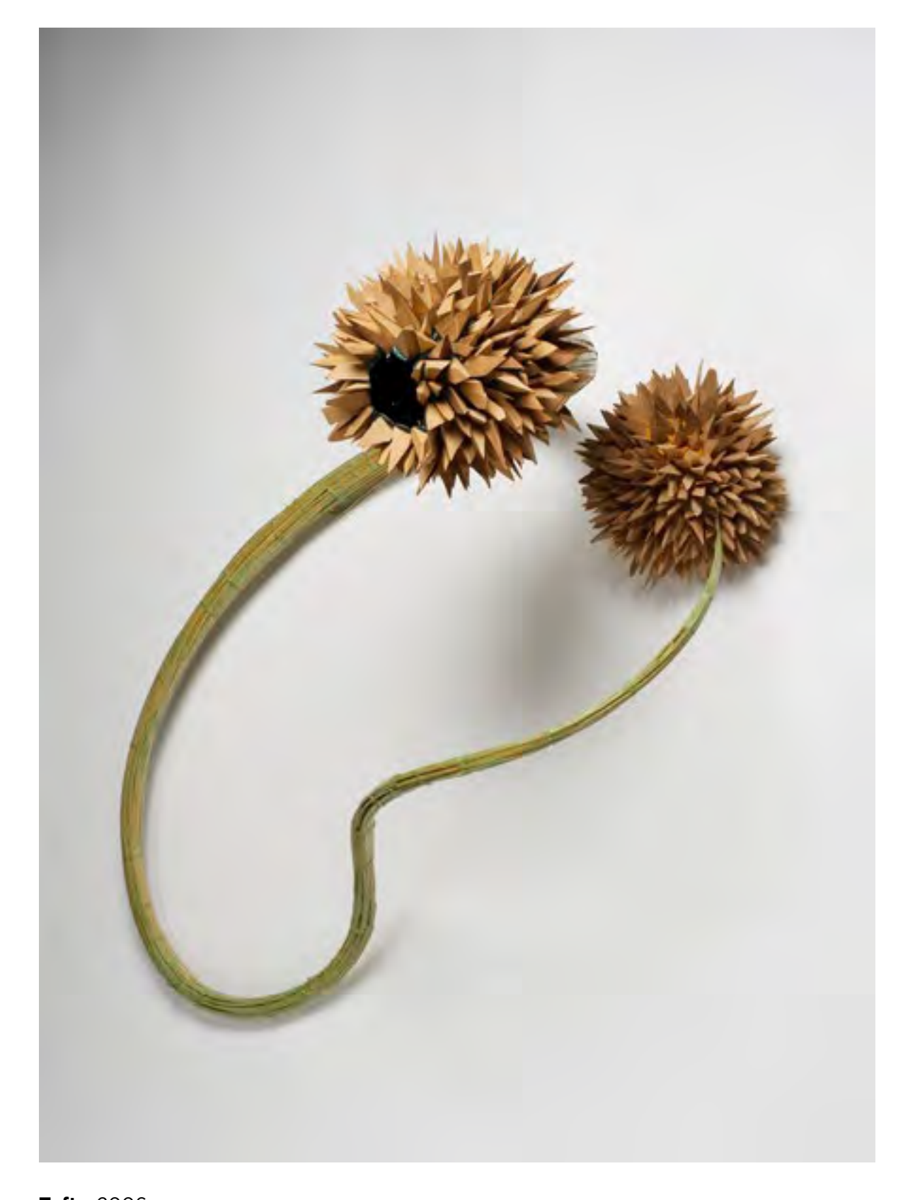
Tufts , 2006 Wood, pigmented epoxy, 72 x 56 x 33 inches