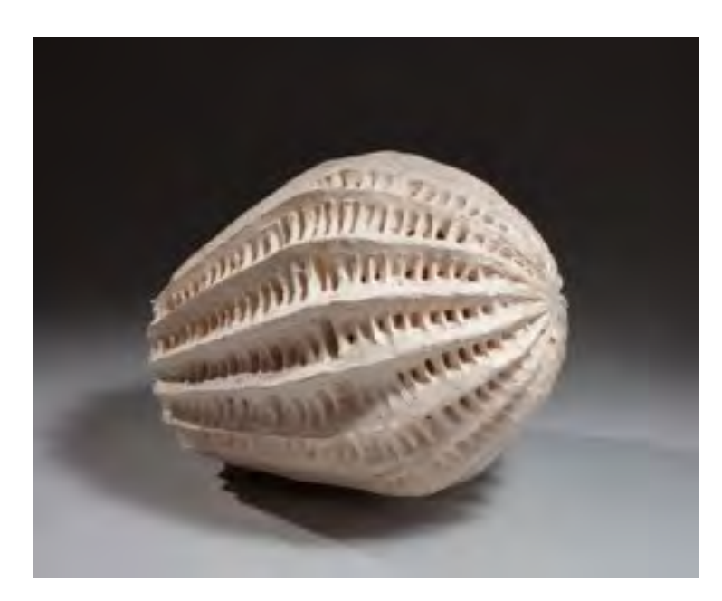
Hull , 2014 Abaca paper, foam, 27 x 23 x 23 inches