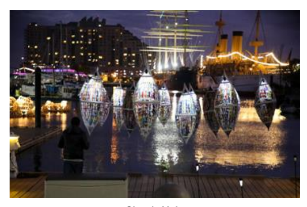
Giorgia Volpe Migration Pathway