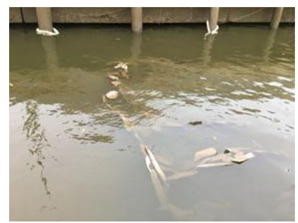
Evident Cycle - imprint & impact