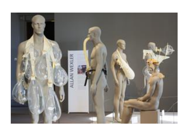
Allan Wexler Installation