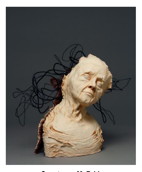
Constance McBride Lonely Girl Room 322