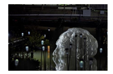
Abu by Miguel Horn.

The rest of the summer and fall was taken up by FLOW , our second collaboration with Independence Seaport Museum and our most challenging exhibition to date. To fundraise for the show and create anticipation, we had a very successful fundraiser, Go with the FLOW , on Cruiser Olympia in July. In spite of the rain, Olympia once again provided a welcoming venue for the large crowd that took advantage of the breaks in the clouds to enjoy the vista of the harbor from the fan deck.