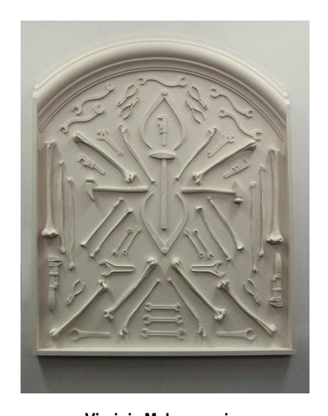
Virginia Maksymowicz Bones + Tools