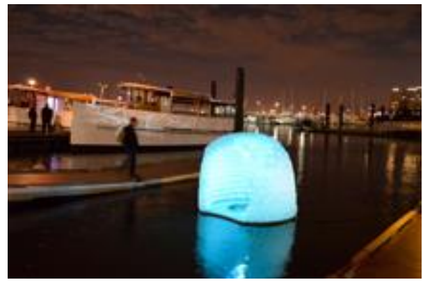
Simone Spicer Convergence, Igloo on the Water