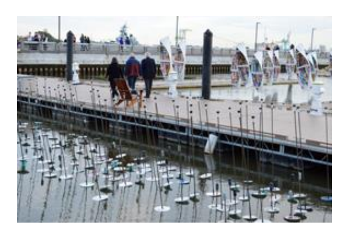
Jean - Yves Vigneau Water Flowers