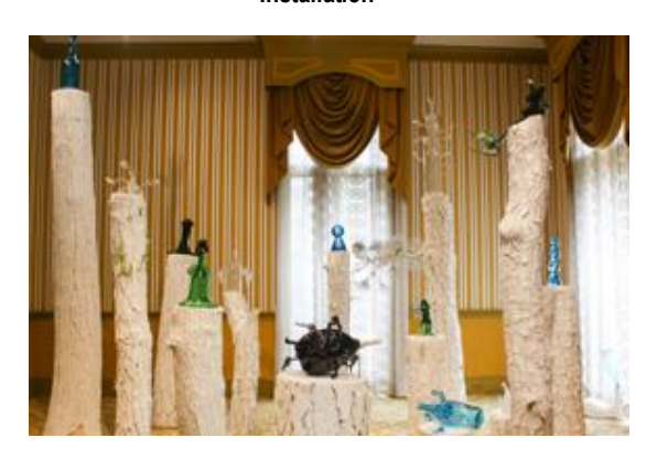
Tristin Lowe Pining for Mystics; walks, talks and molten rabbit holes