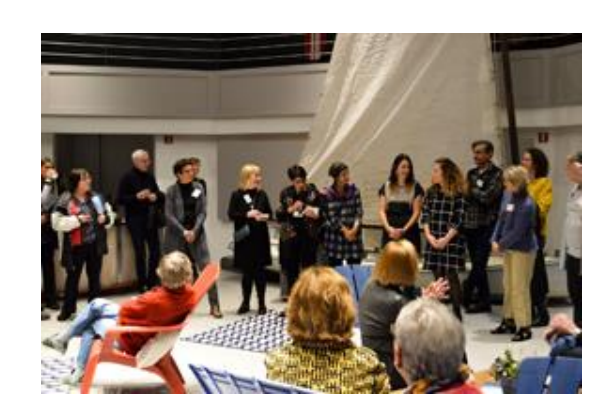
Artists at reception