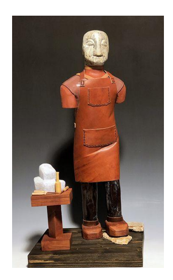
Paul Wandless Maker

John Y. Wind's solo show The Women was at InLiquid Gallery at Crane Arts, November 14 – December 14, 2019. An article about The Women , by A.D. Amorosi, was included in Dosage Magazine's November 11, 2019 issue.