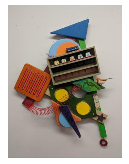
Jack Knight Blue Caboose