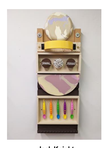
Jack Knight Ontario Series #11