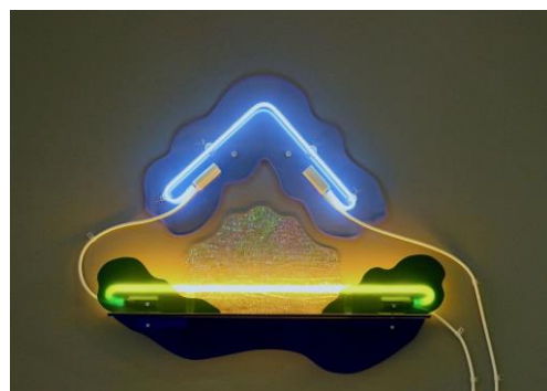
Yellow/Blue Oxygen Flow Lisa Nanni