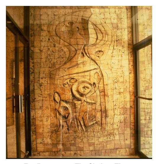
Family - once at The Shubert Theater

That Monday I made about 20 calls to various people, including a lawyer to get an injunction. Nothing. The architect dismantled the mural into blocks. While this was being done, because I could not afford the huge storage fees, I called several institutions who might be interested in the mural. One was in Chester County.