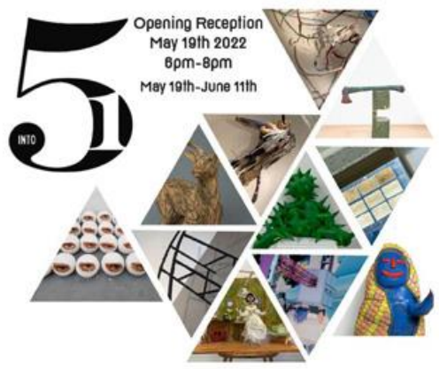
1st floor Atrium at Tyler School of Art and Architecture 2001 N. 13th St, Philadelphia, PA