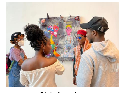
5 into 1 opening