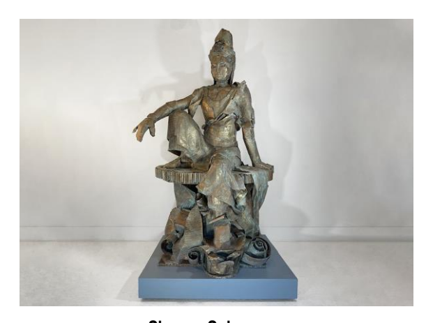
Simone Spicer KUAN YIN WATER MOON