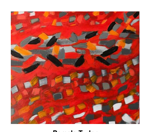
Pamela Tudor They are Everywhere