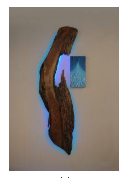
t. a. hahn Bluebird of Happiness