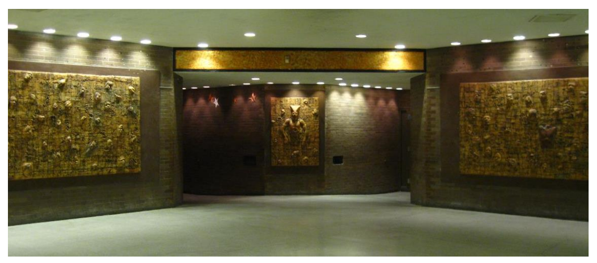
African American History/Black Lives Matter - originally at University City High School, half of it is now at Moore College of Art and Design

A long time ago I did a 7'h x 50'w ceramic mural commissioned under the auspices of the city's One Percent for Art Program, at the now defunct University City High School. I did it with the assistance of about 100 students and art teachers.